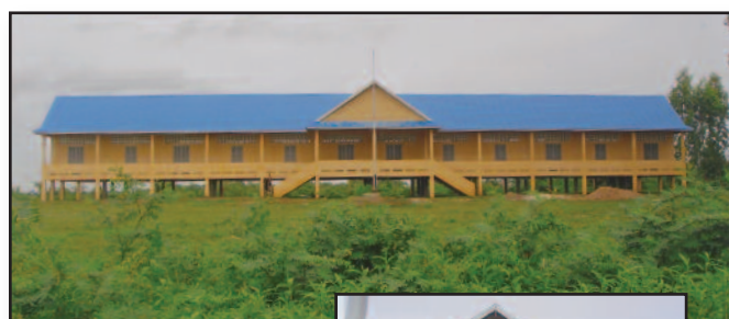
In our 1st school in Cambodia, 600 children are being educated every day

There will be a $2.00 per person plating fee if you bring your own cake.